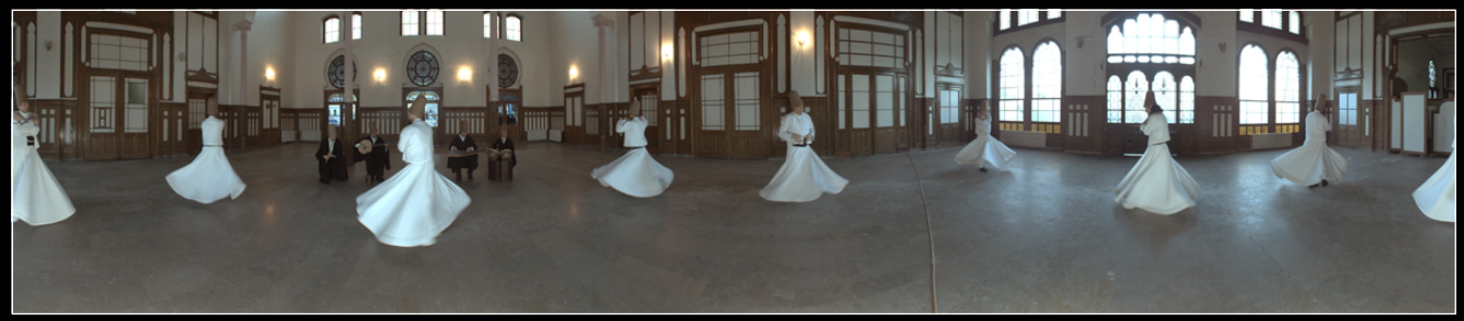
Vertical FOV: 67 degrees