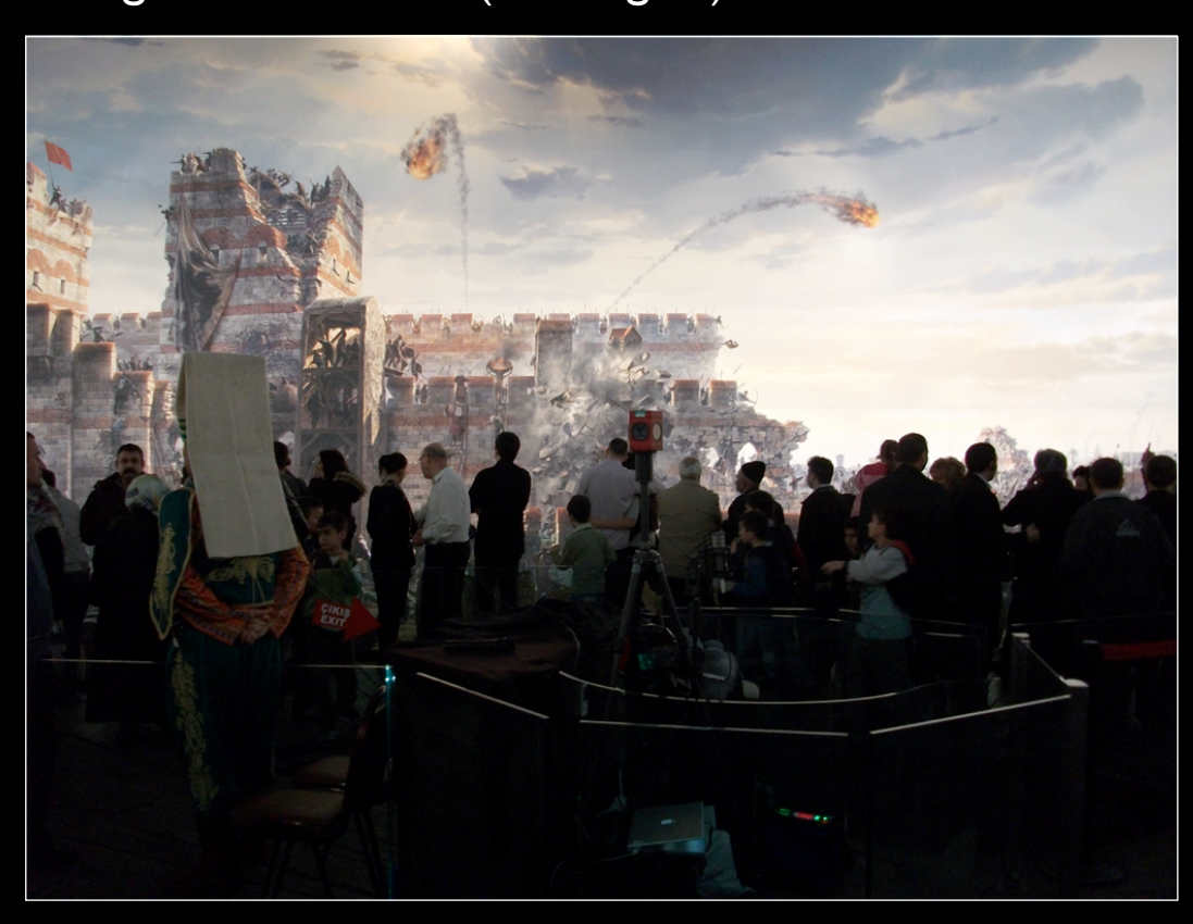
Panorama 1453: Capture of Istanbul by the Turks